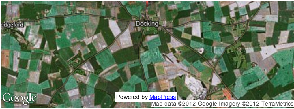
Offshore WIND Staff, July 17, 2012; Image: Tidal Transit