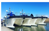
Photo of the Day: Tidal Transit Sisters All Dolled Up